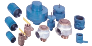
Relief & Check Valves