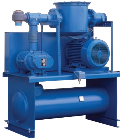
Pre-Piped Blower Packages