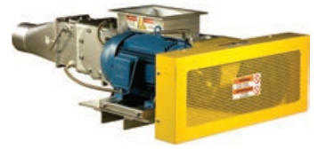
Pneumatic Screw Pumps